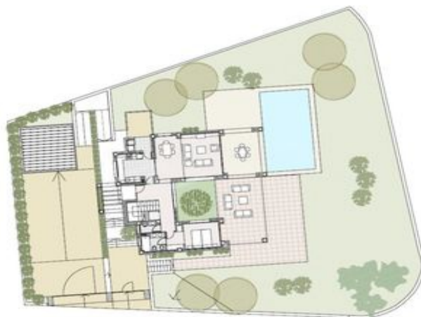
Ejemplo de implantación en parcela B5. Ejemplo de un plot B5